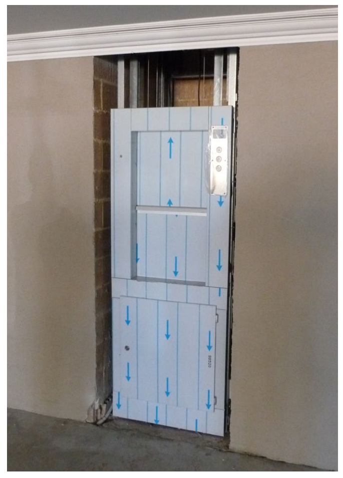
Ground floor in garage.