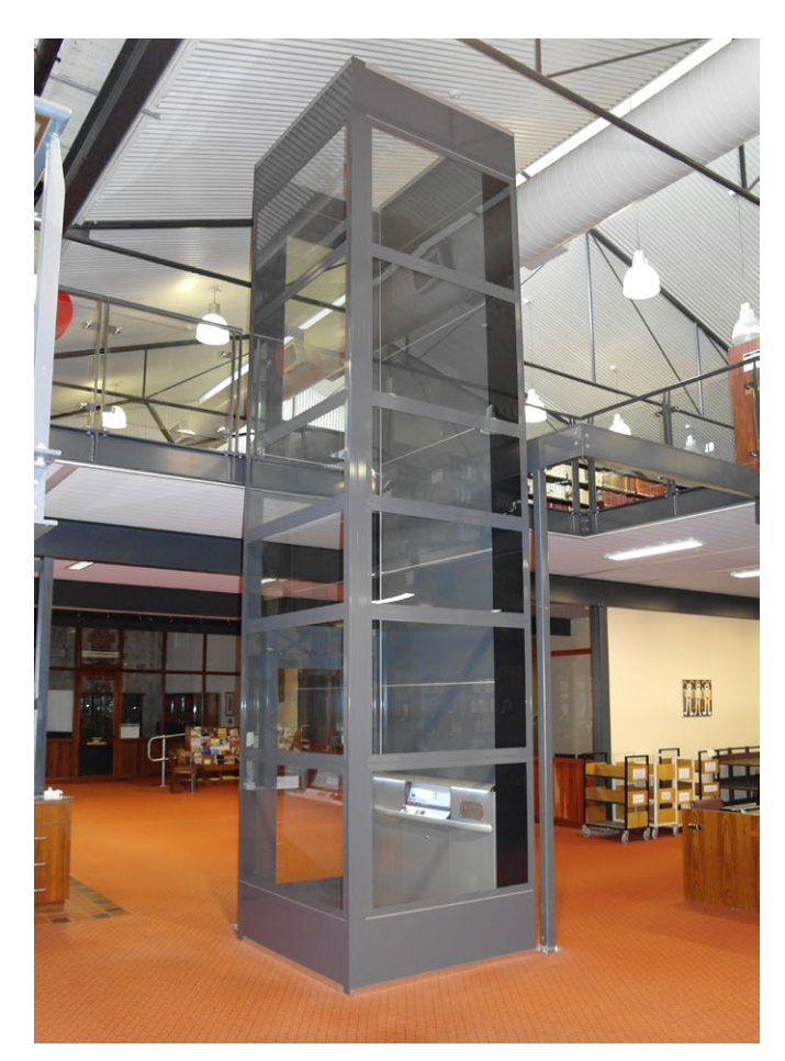
A5000 - Notre Dame: