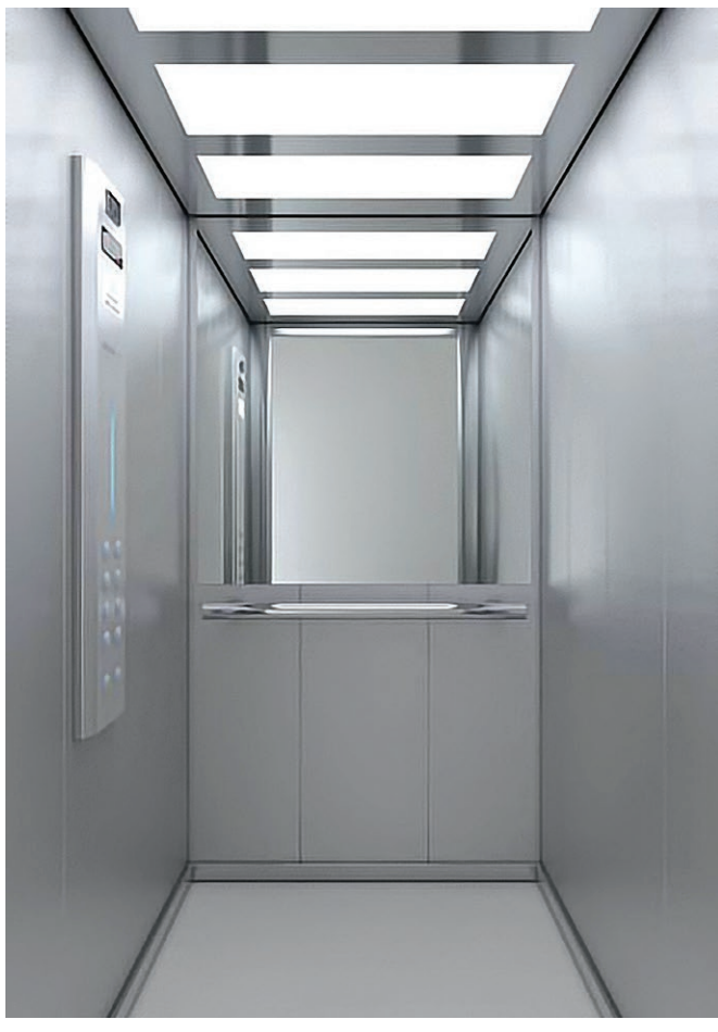
MODERN LIFE L310