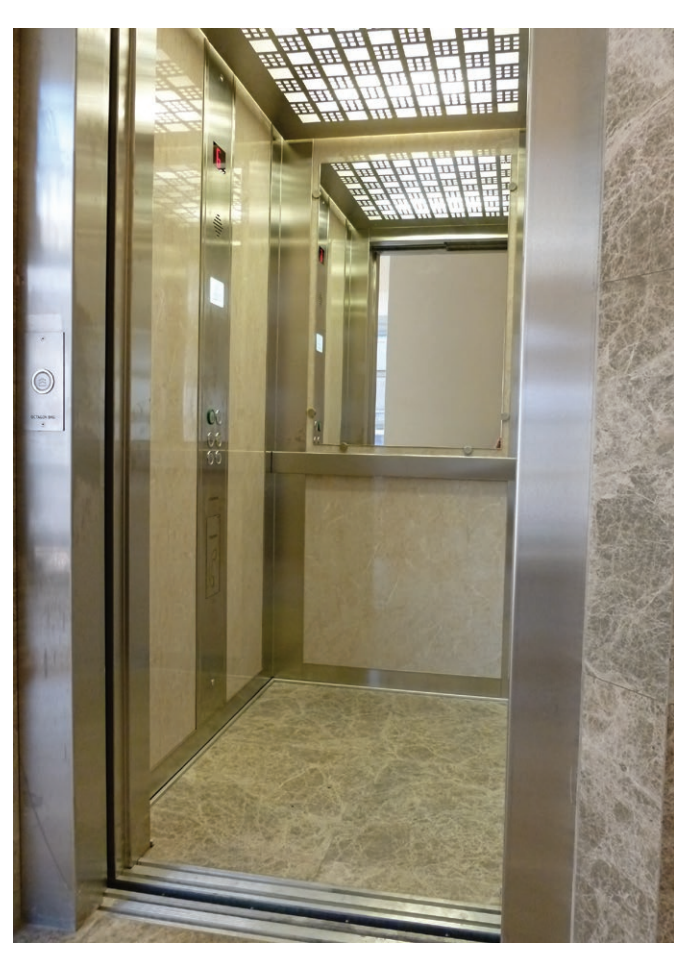
450 kg lift: Bateman Road