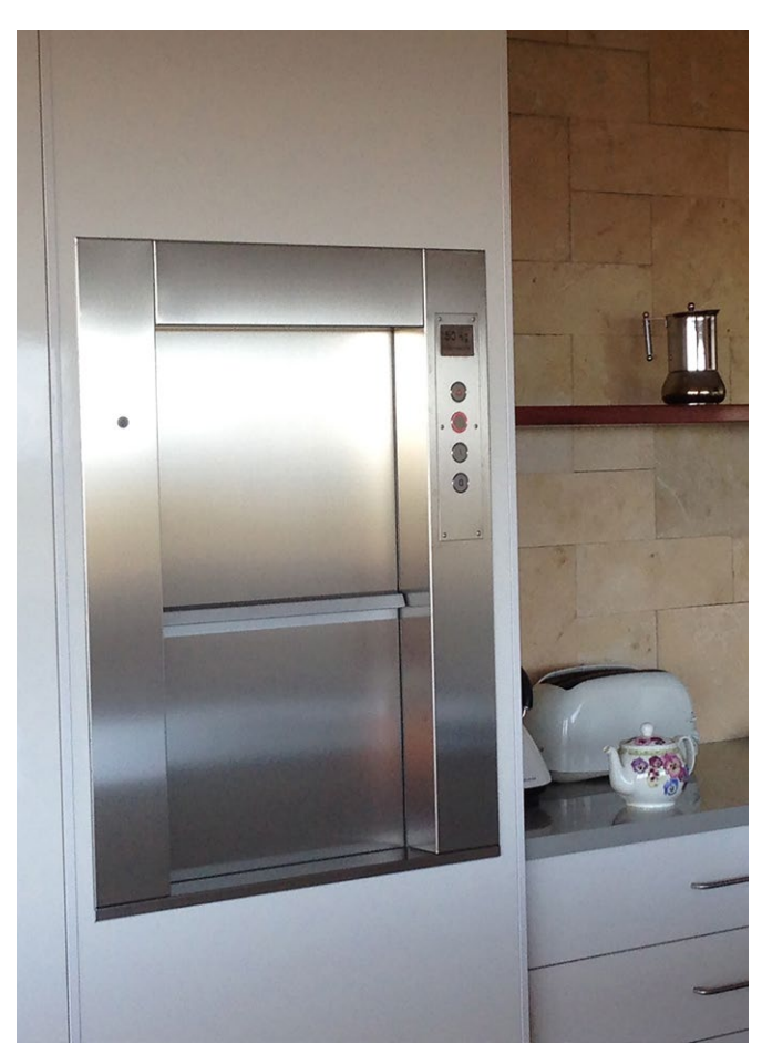
50kg Service Lift.