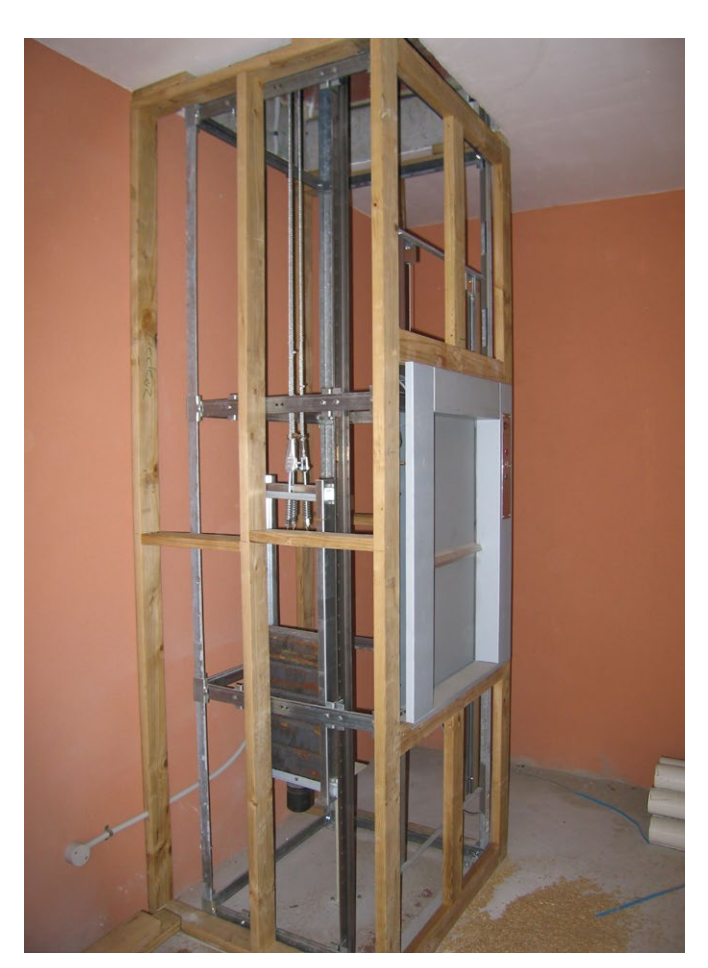
View from the side.