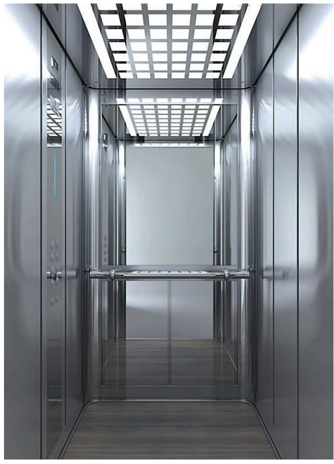
MODERN LIFE L530