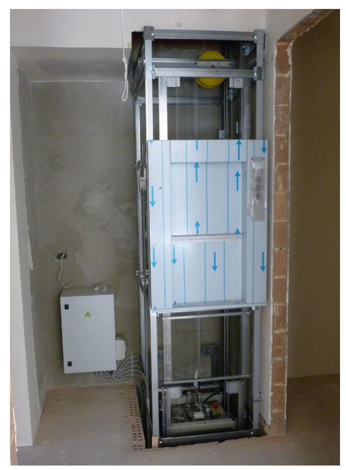
Top floor showing Control Box.