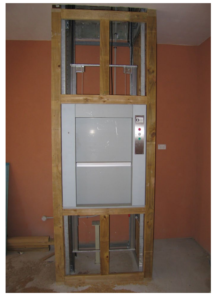
Self-supporting frame with stud wall surround.