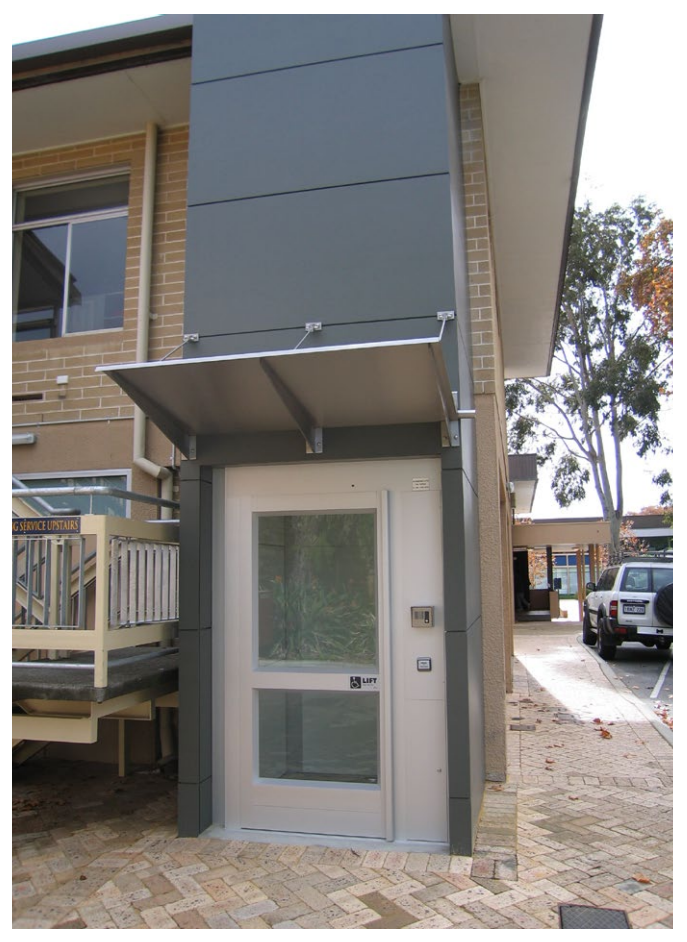
Existing building - Christchurch Grammar: