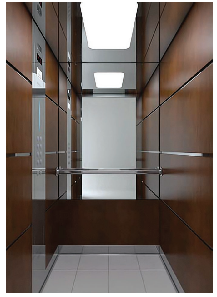
CLASSIC ATHENA A510