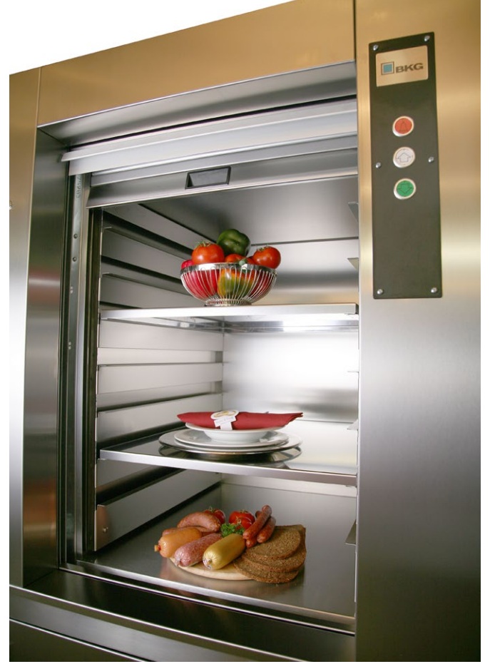
100kg Service Lift.

Note: All linear dimensions are in mm. Standard sizes are provided for example only and are not to be used for construction. Custom load and car size is available.