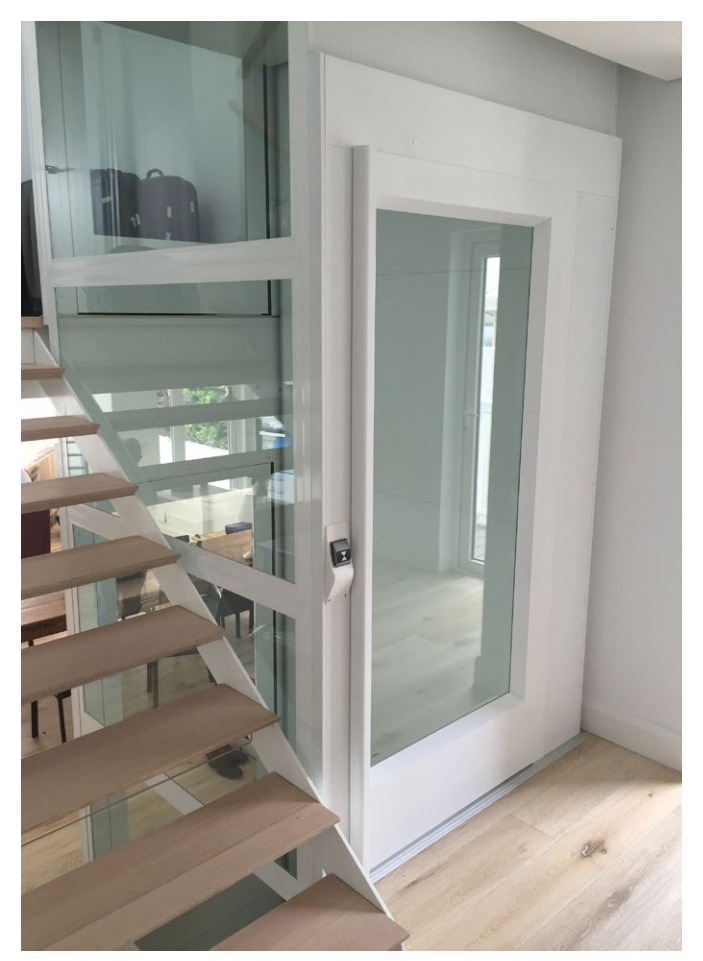
Cibes A5000 - Webb St, Cottesloe: