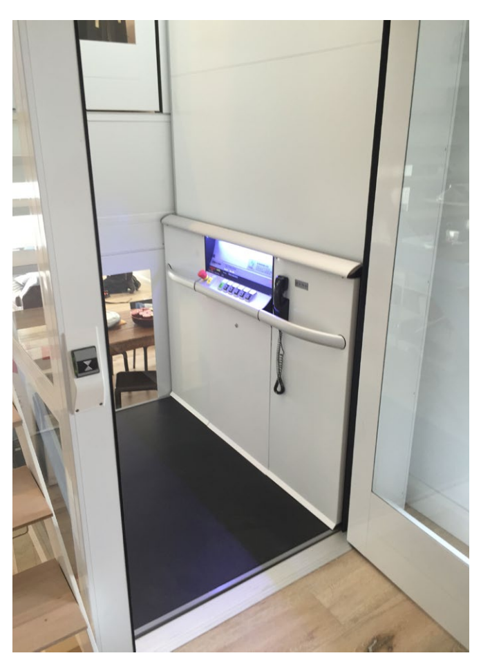
Cibes A5000 - Webb St, Cottesloe: