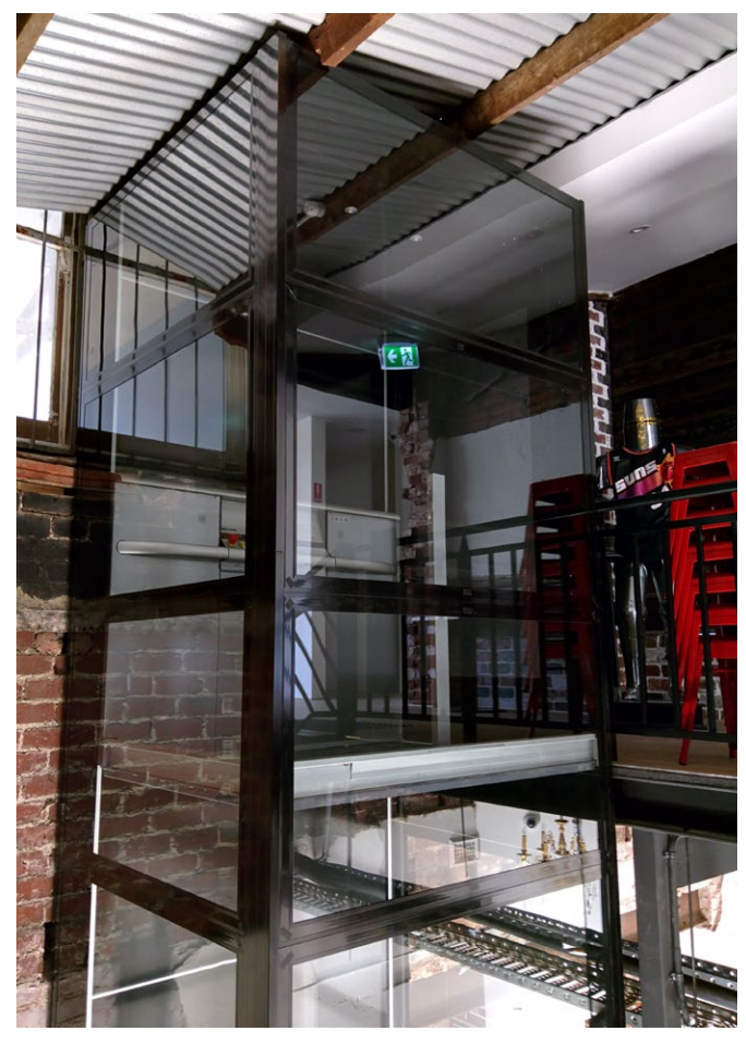
A5000 Glass Shaft - Eight Avenue, Maylands: