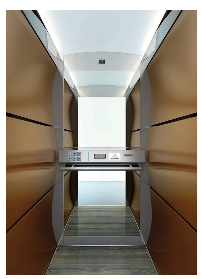
FUTURE TREND T711